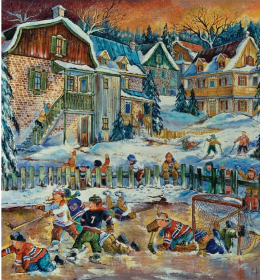
Lise Labbé, Les enfants du village, 36 x 36 Oil on canvas