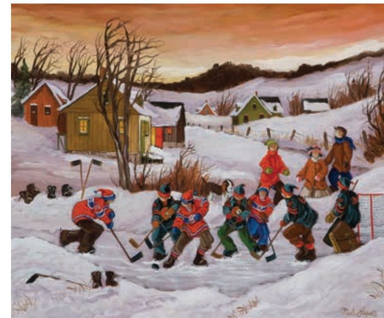
Nicole Laporte, Rang 4 -vs- rang 7, 20 x 24 Oil on canvas

The gallery's primary product is original paintings and sculptures, but it also carries limited edition prints, greeting cards, art books