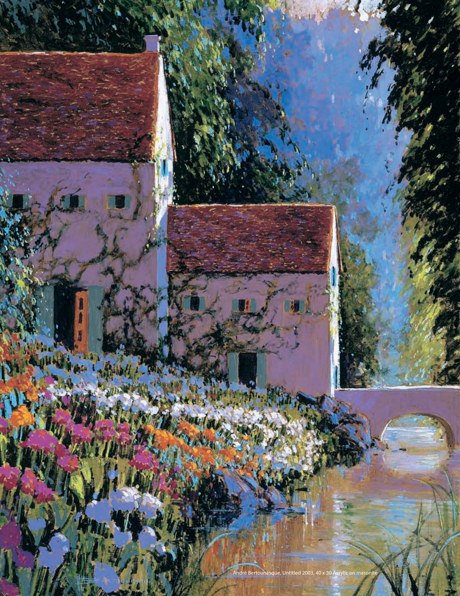
André Bertounesque, Untitled 2003, 40 x 30 Acrylic on masonite