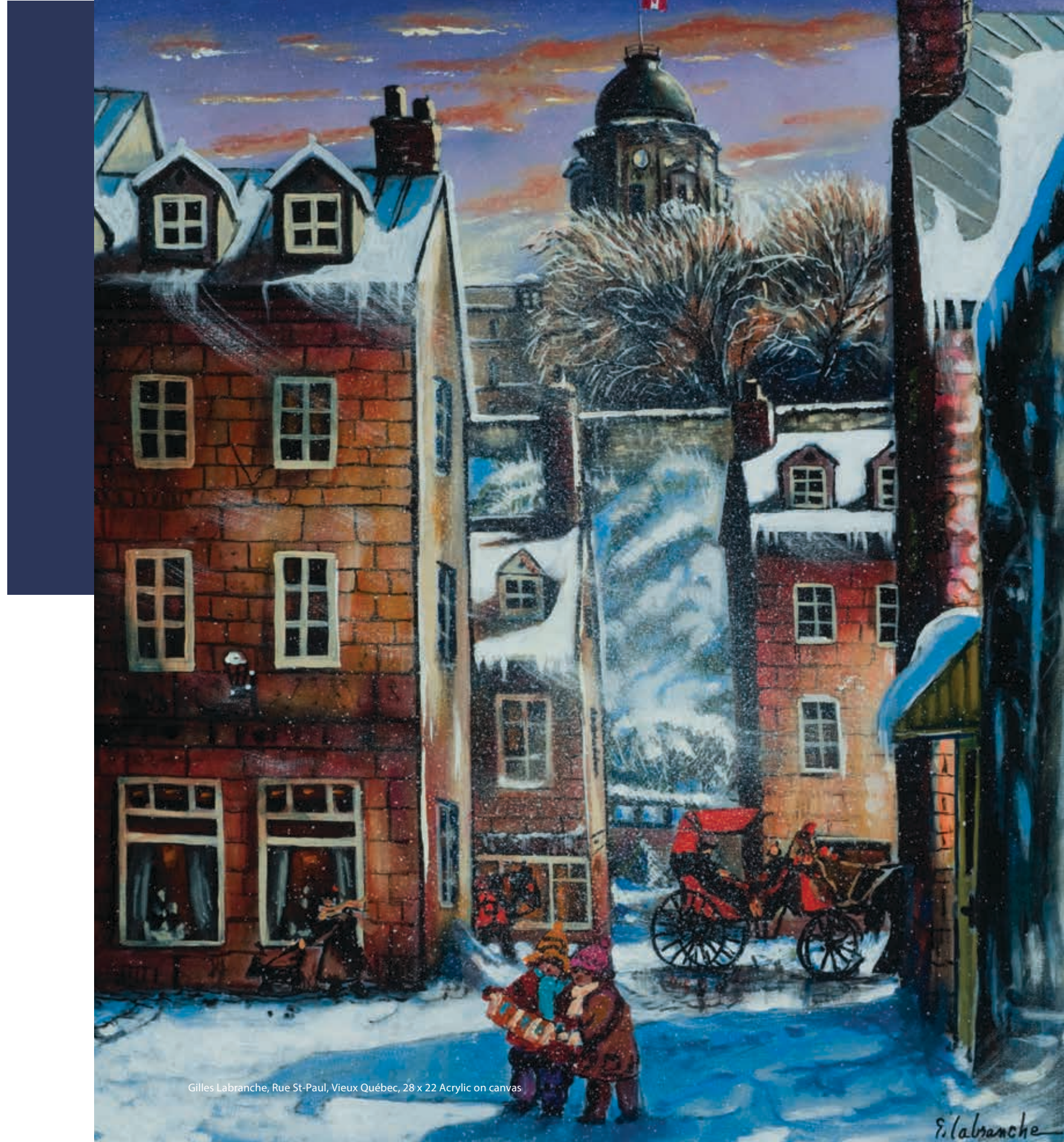
Gilles Labranche, Rue St-Paul, Vieux Québec, 28 x 22 Acrylic on canvas

You can visit Le Balcon d'art at 650, rue Notre-Dame, Saint-Lambert, Quebec, Canada or telephone 450.466.8920 or go to www.balcondart.com .