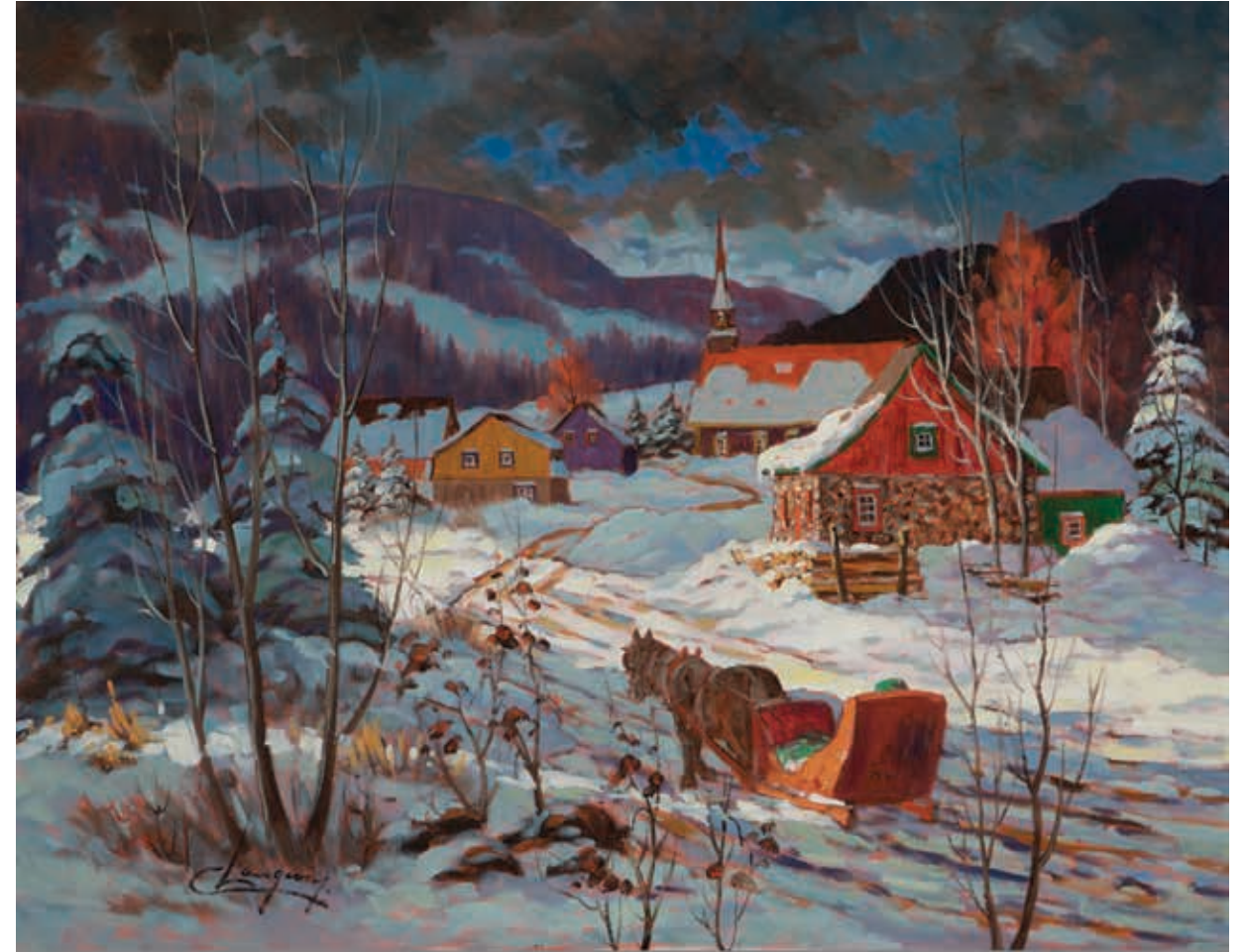
Claude Langevin, Percée de lumière, 24 x 30 Oil on canvas

great painting to share with the next generation to own the painting.