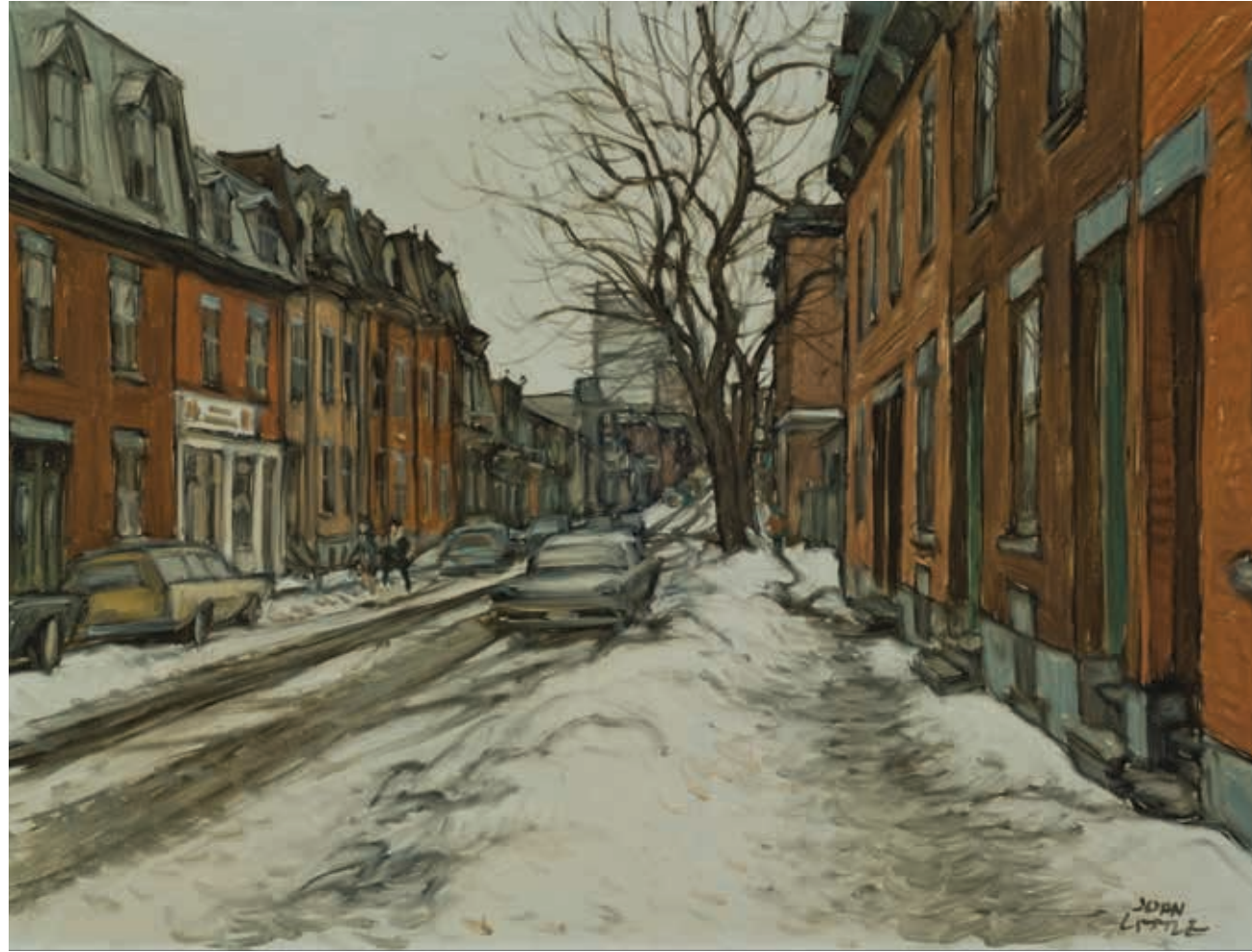
John Little, Rue St-Christophe, 12 x 16 Oil on Canvas

and magazines, high-end vases and glasswork, easels and much more. Personalized services include custom framing, evaluations, restoration, advice and gift registry.