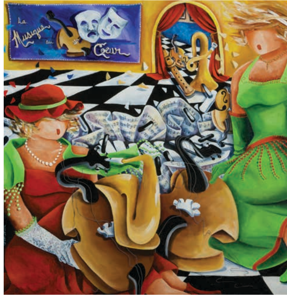
Marc Galipeau, La musique au Coeur, 30 x 30 Acrylic on canvas